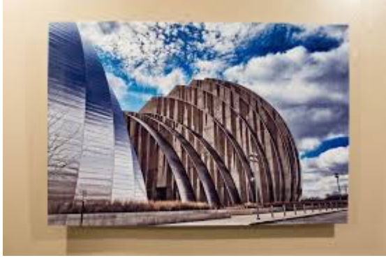
Example of commercial quality metal art