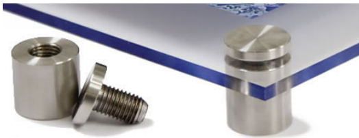
Close-up view of mounting example