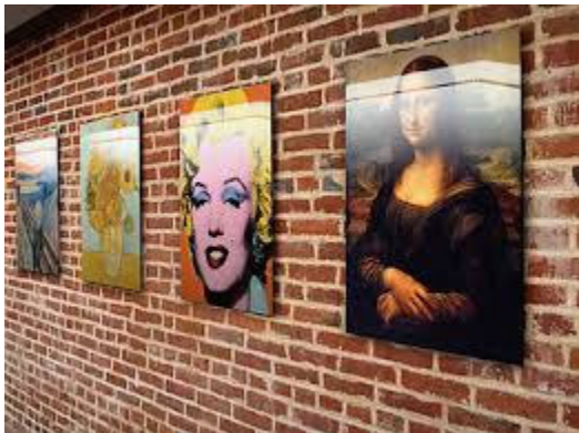
Example of installed metal art

Representative photos of metal art and mounting are attached.